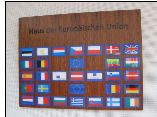
Haus der Europäischen Union 1010 Wien