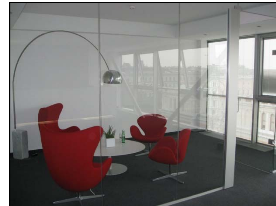
Liechtensteinische Landesbank 1010 Wien