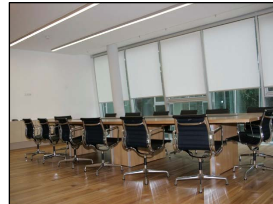
SLAV Handel, Vertretung und Beteiligung AG Alteration 1010 Wien